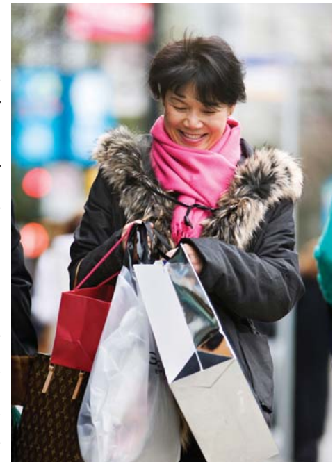
The cold weather or going outside without a hat isn't a direct cause of colds and the flu.

Whether it's rain or shine, cold or hot, the best way to avoid colds and the flu is to wash hands thoroughly and regularly, eat a healthy diet that keeps the body in illness-fighting form and avoid others in close quarters when they are sick.